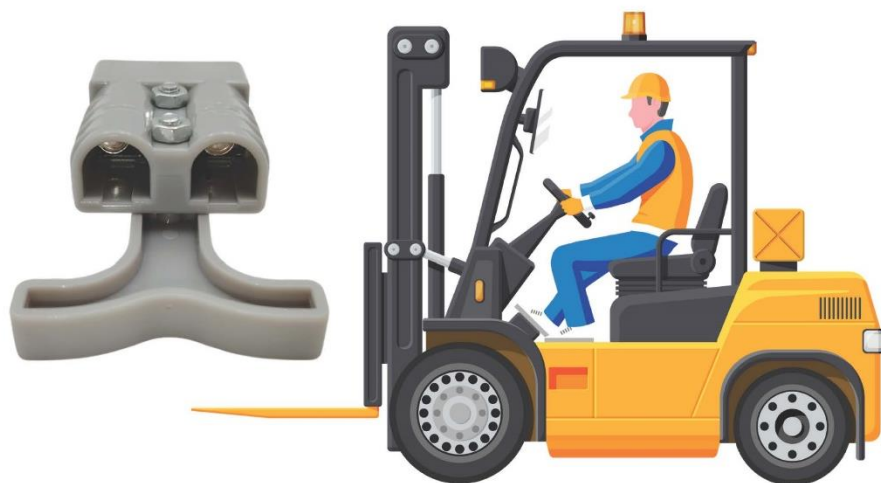
Electric Forklift Truck/电动叉车