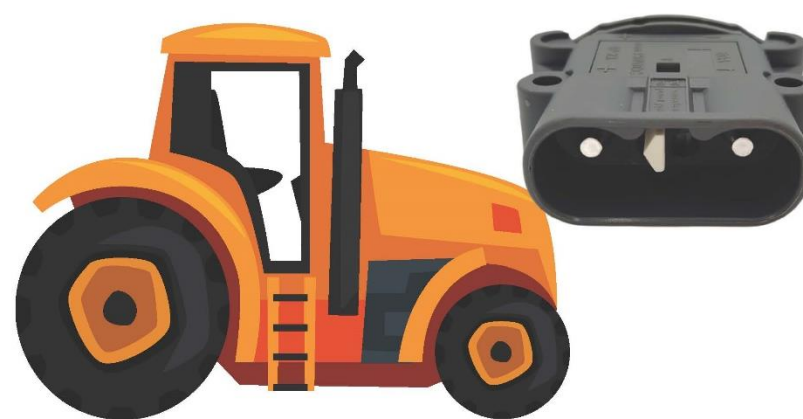
Electric Farm Machinery/电动农机