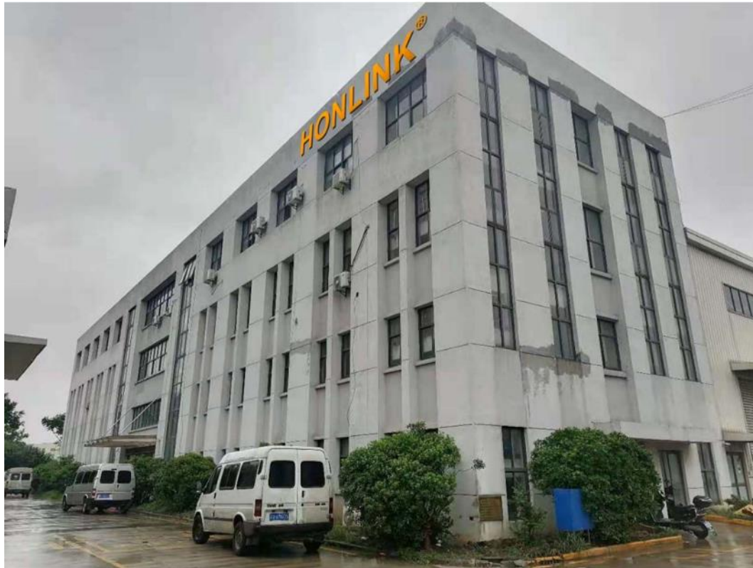
KUN SHAN Factory