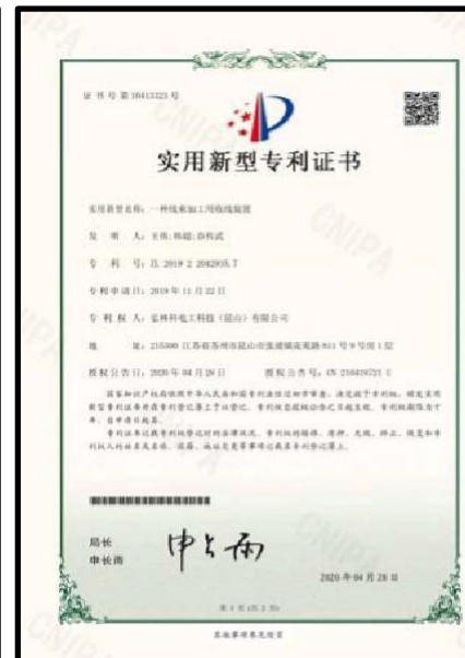
More than 20 Patent Certificates