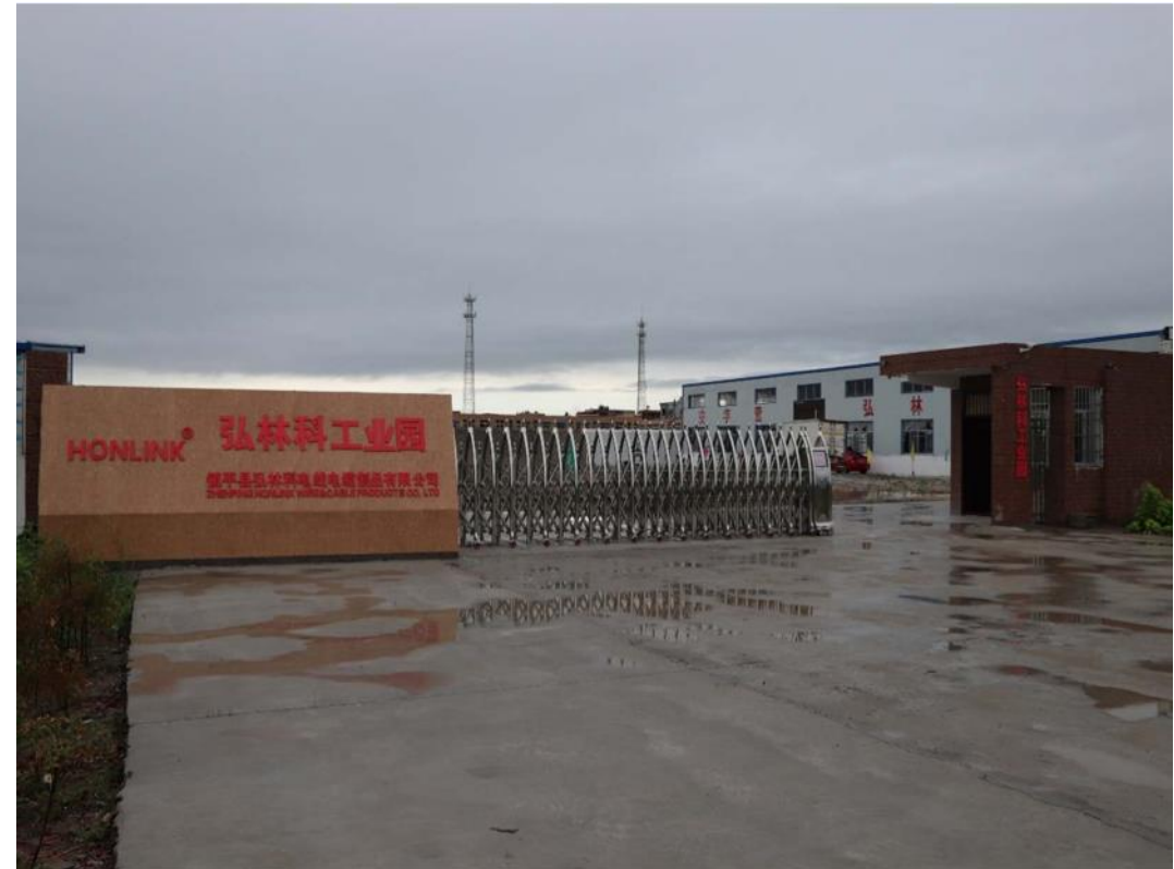
HE NAN Factory