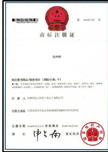
Chinese/English Trademark Certificate