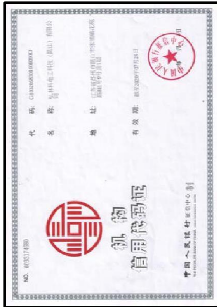
Letter of Credit