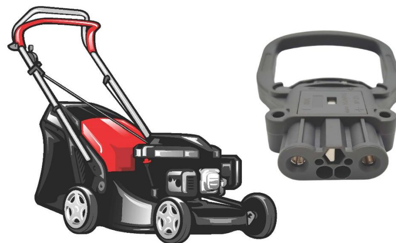
Electric Lawn Mower/电动割草机